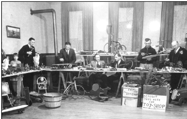
A K of C council sponsors a Christmas toy drive.

The Great Depression initially had a detrimental effect on the Order's membership and finances, but it also led to a renewed sense of volunteer service. The success of an extensive membership campaign in 1935, titled Mobilization for Catholic Action, led to the establishment of the Order's Service Department, which subsequently launched a "Five-Point Program of Progress." The program encouraged councils to play a more active role in the life of the local parish and community, and included five categories: Catholic activity, council activity, fraternal protection, publicity and maintenance of manpower.